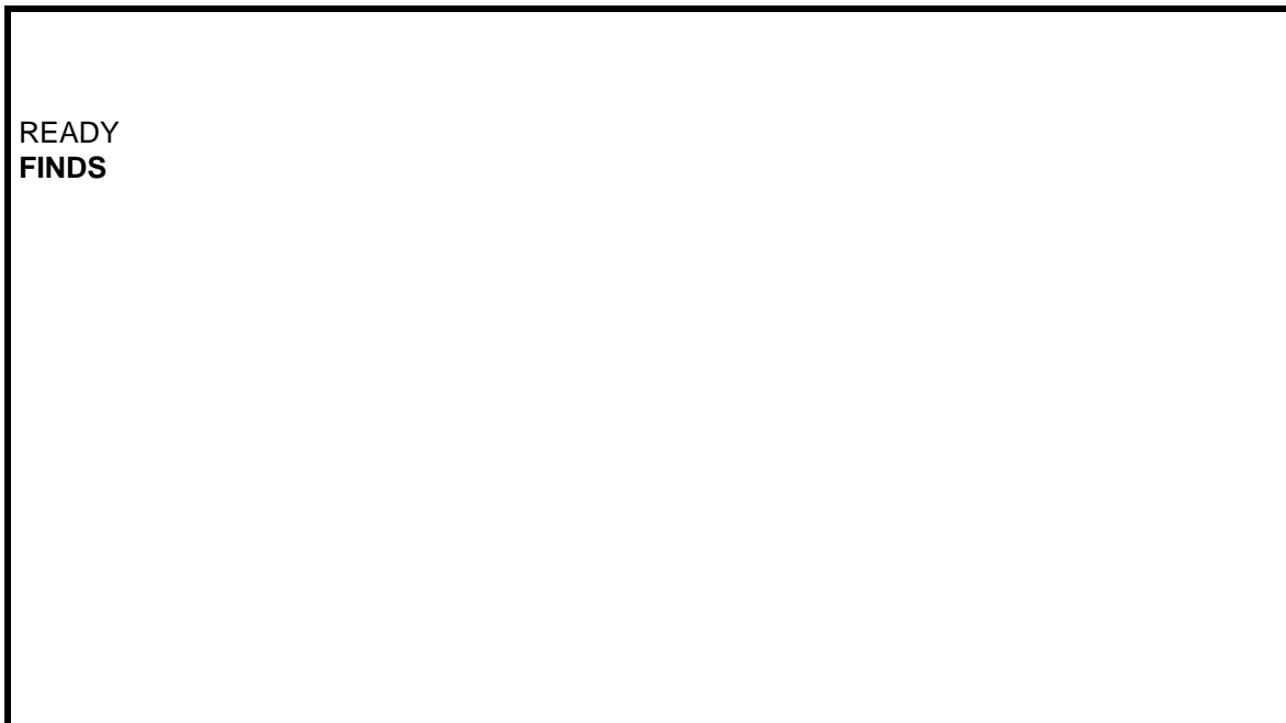
Figure 3 - DIT "READY" Prompt.

The "READY" Prompt will now display, as illustrated in Figure 3.